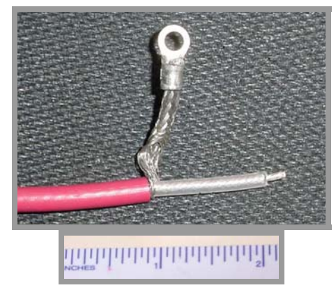
Figure 2 - HV Cable Prep Through Step 4