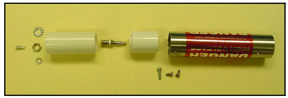
Figure 5 - Cable Assembly and Parts Ready to Start Step 9