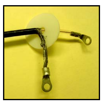
Figure 3 – HV Cable Prep Through Step 6