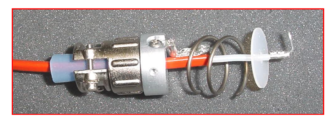
Figure 3 - Assembly Through Step 7