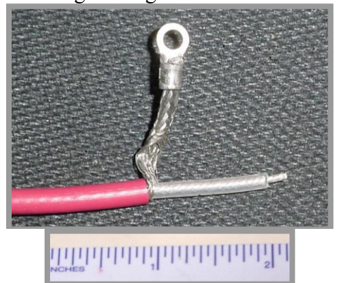
Figure 2 - HV Cable Prep